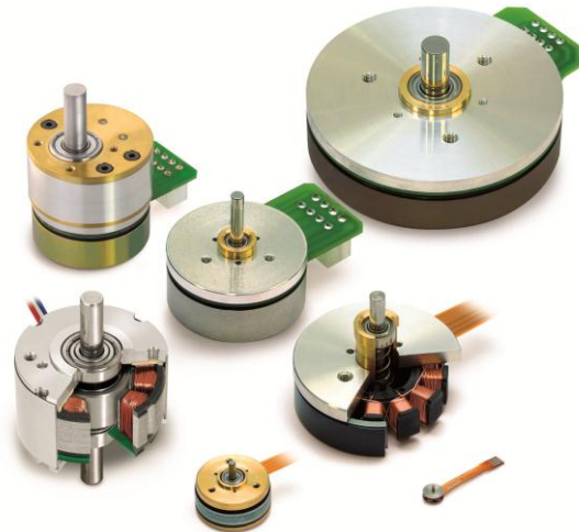
Figure 5: maxon manufactures a wide variety of EC flat motors for different kinds of applications.