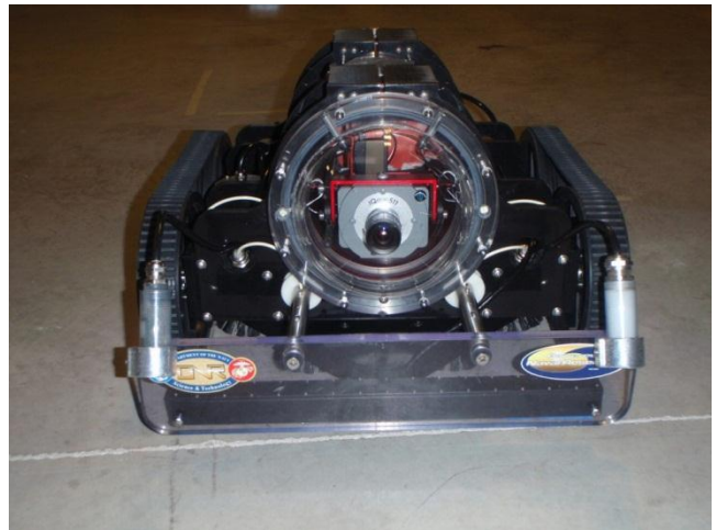
Figure 3: This close-up of the HullBUG clearly shows its sensor alignment system that helps it keep on course while cleaning a hull.

An autonomous vehicle is often software heavy in terms of engineering efforts once you’ve selected and implemented the proper motion control system. Getting smooth reliable navigation maneuvers that result in accurate positioning in a widely varying environment was one of the more difficult challenges for the design team. Multiple layers of software were necessary for handling the number and variety of possible events that can occur during grooming. And, the proper organization of the control logic to allow extensibility of navigation behavior was the most difficult part of this complex system. “Software development will continue to be an ongoing effort even after the years already put into it,” Ken said. “Though the vehicle is completely operational, there remains a considerable amount of on-ship test-ing to be done.” As the project moves forward and into the field, there will no doubt be additional issues that will crop up and need to be addressed, as well. Even now, the vehicle must be able to reliably accomplish its task in a hostile environment and in an unmapped terrain. Then it has to be able to return to the waterline of the ship for retrieval.