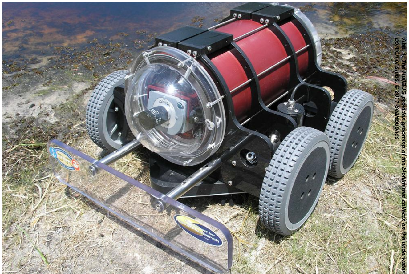
Abb. 1: The HullBUG provides grooming of the biofilm that collects on the underwater portion of ships.